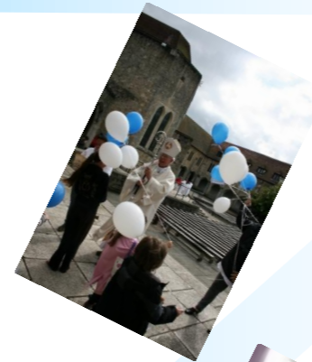
Grandparents in Aylesford