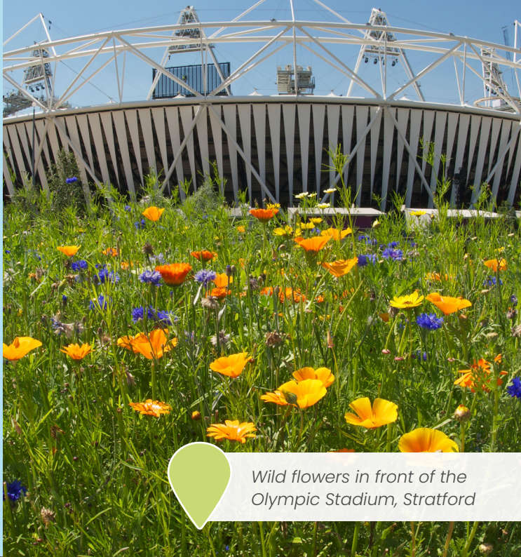
Wild flowers in front of the Olympic Stadium, Stratford

“In every living creature, there is a trace of the Trinity”