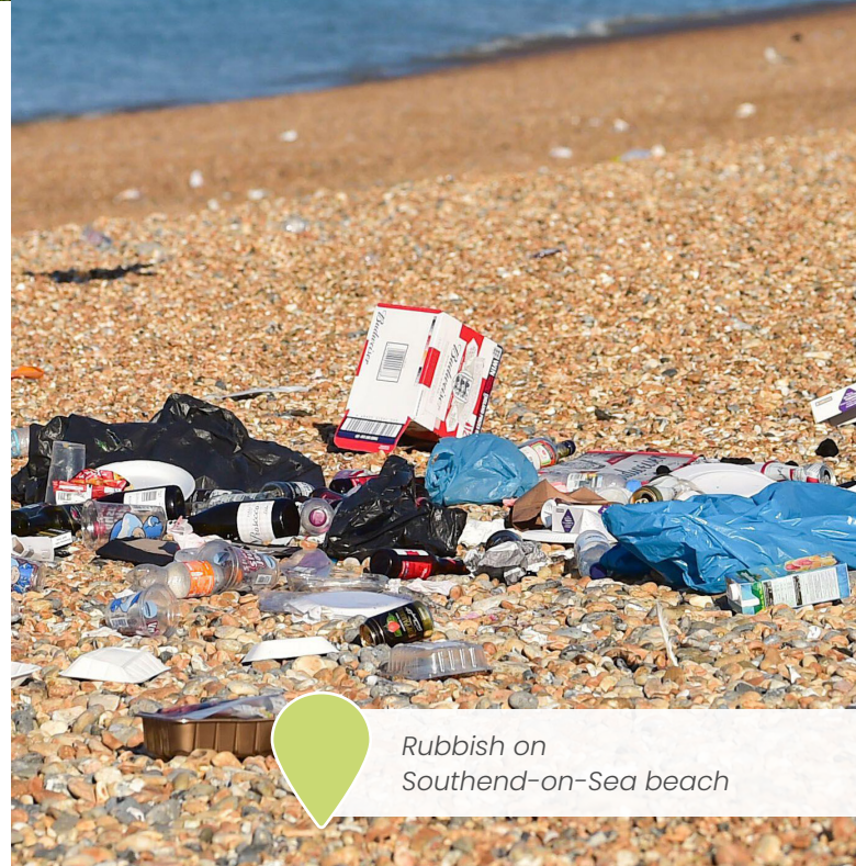
Rubbish on Southend-on-Sea beach

A personal invitation to every Catholic in Brentwood Diocese to pray and act, to cherish God's creation and strive for justice for the world's poorest people.