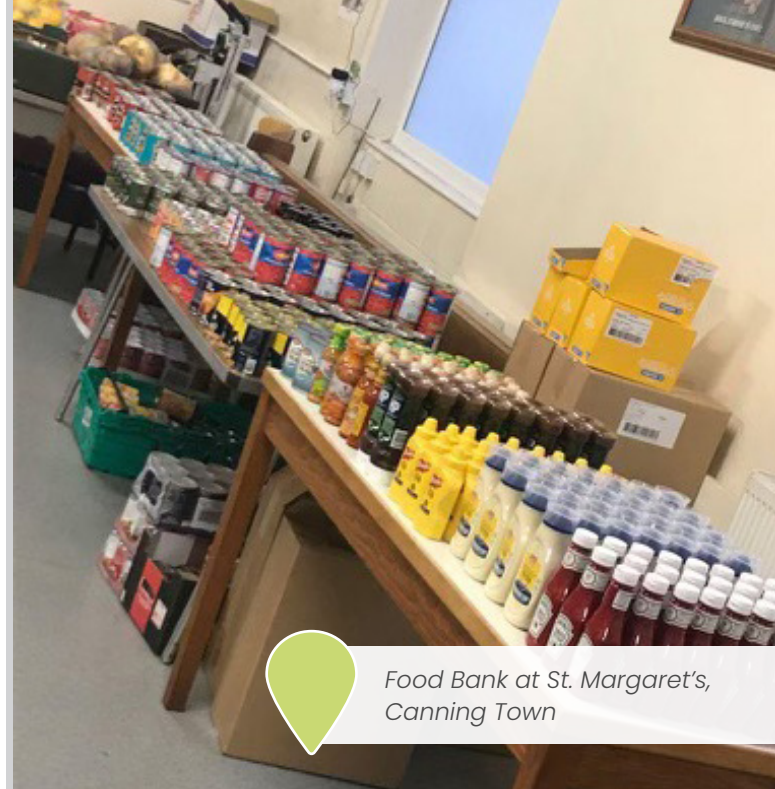
Food Bank at St. Margaret's, Canning Town