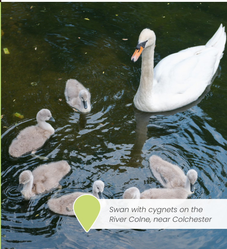
Swan with cygnets on the River Colne, near Colchester

“The earth, our home, is beginning to look more and more like an immense pile of filth. In many parts of the planet, the elderly lament that once beautiful landscapes are now covered with rubbish.”